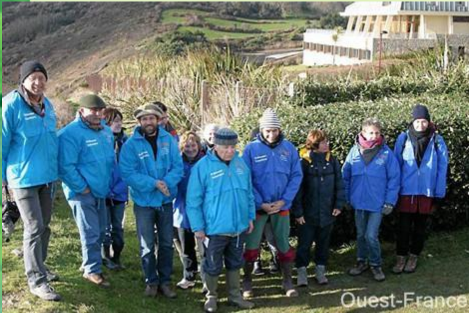
Port en Bessin (mars 2010)