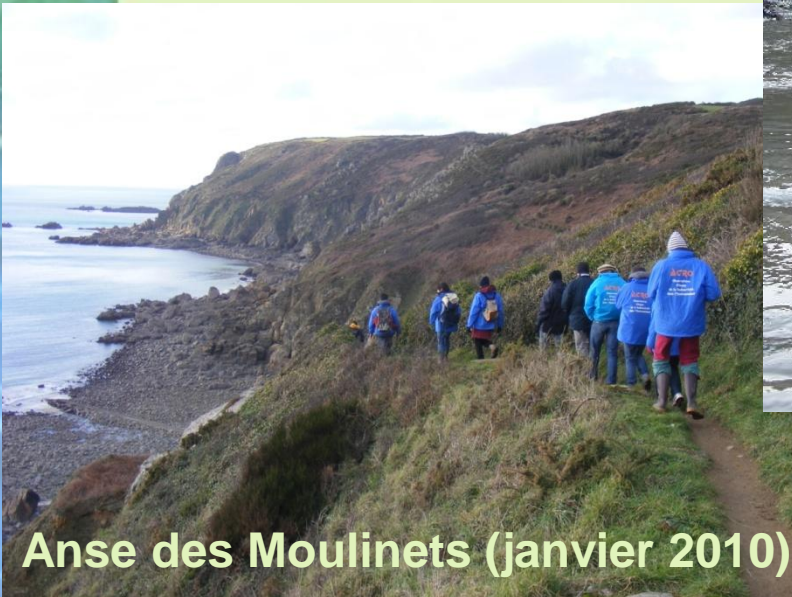
Anse des Moulinets (janvier 2010)